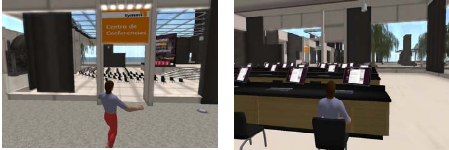
Figures 2 & 3: Places and learning resources available at TYMMI Open Sim

In this virtual environment we have placed classrooms, learning resources, blackboards, computers, and projectors (see Figures 2 & 3).