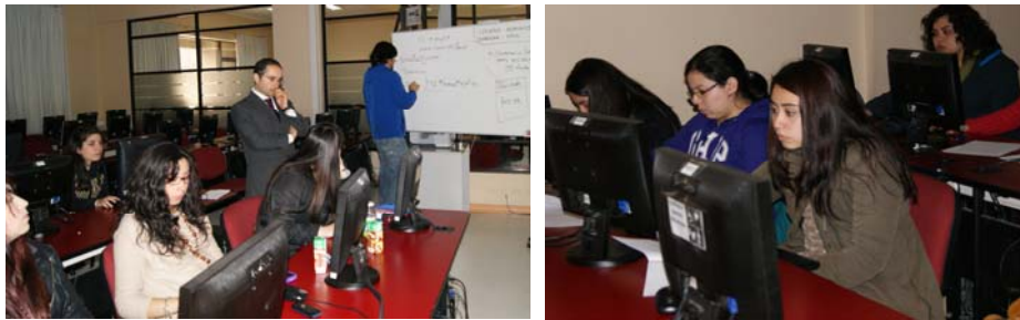
Figures 4 & 5: Workshop Second Life, Moodle and Open Sim.

The readiness training section lasted four hours. The participants were freshmen pre-services high school English teachers. The training was focused on learning how to use Moodle platform which is supported by a Learning Management System (LMS) ( http://www.tymmi.cl/lms2 ) and also they learned about its usability as an immersive platform.