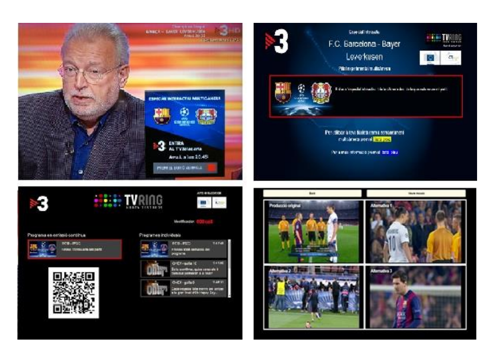
Fig. 2. Screenshots of application during open live pilot tests

This first phase of controlled-sample pilot tests set the stage for the two large-scale open pilots. A preparatory pilot was carried out in September, with news coverage of the Catalan national day rally, to ensure the successful deployment of the envisioned live pilots. The selected contents for the live pilots were two FC Barcelona football matches in September and November 2015. These open live pilots were followed by an audience of about 4000 and 6200 TV devices which accessed the project's HbbTV application (see Fig. 2), representing an audience of thousands of users interacting with the offered multicamera services. Extensive data was obtained on the patterns of usage of the application, technical performance parameters and several metrics of user satisfaction. An in-depth analysis of these data has yielded rich information on HbbTV market penetration potential, models of user segmentation and clustering, and analytics on the user's behavior in real-life settings.