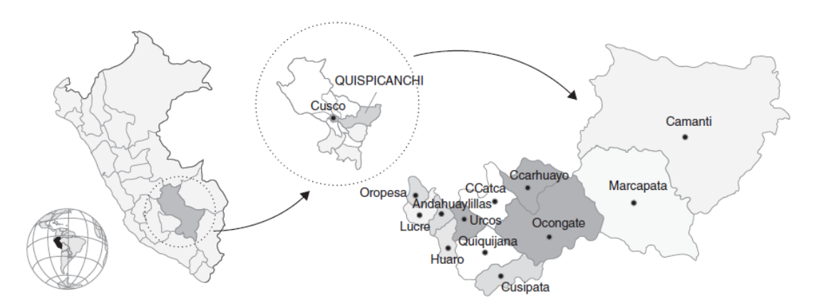
Fig. 2. Quispicanchi location. Source: Guix and Pi, 2012: 77.

The case of the cultural attraction of the Andean Baroque Route (henceforth ABR) illustrates the relationship between the ITDP methodology and cultural heritage, including San Pedro Apostol Temple in Andahuaylillas, Huaro and Canincunca Temples, and the Company of Jesus Temple in Cusco, which belongs to the Jesuit Company. This route consists of various churches from the 16th to 18th centuries, and can help local tourism by revitalizing Quispicanchi as an alternative to the saturated Cusco Sacred Valley. Its tangible and intangible cultural assets present local communities with opportunities to promote cultural immersion experiences for domestic and foreign tourists' encounters with the region's hosts.