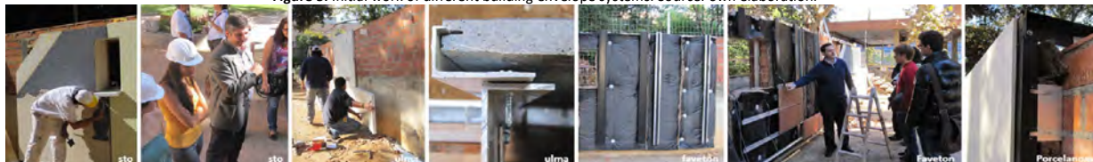
Figure 5. Initial work of different building envelope systems.

The second stage is both theoretical and practical, as it involves conferences and roundtables, where the various building systems are discussed with industry professionals, architects and teachers. Therefore, this constructive discussion aids in the students' understanding of the course content, allowing them to appreciate the existence of more than one possible solution to the same problem.