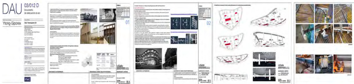
Figure 3. An example of seminars (Martí et al., 2014).

The proposed program is based on active training seminars, as a part of which the students participate in the development of their own knowledge and improve the quality of their work by applying different learning techniques. The structure of these seminars is based on participatory lectures, "Pills" (exhibition of images), and practical tasks, as this allows several themes to be explored in each session (Marchesi, 2004a). The main advantage of these sessions is their participatory nature, which is ensured by instructing students to prepare for the seminar by consulting the notes on the subject using the eStudy platform, allowing them to address any doubts or questions to the teachers and they self. The "pill images" sessions introduce an abstract concept into a concrete situation, allowing the students to contextualize and understand it better. The images pertain to the site projects that the faculty members are working on, and may include both photographs and videos of implementation processes pertaining to different building systems.