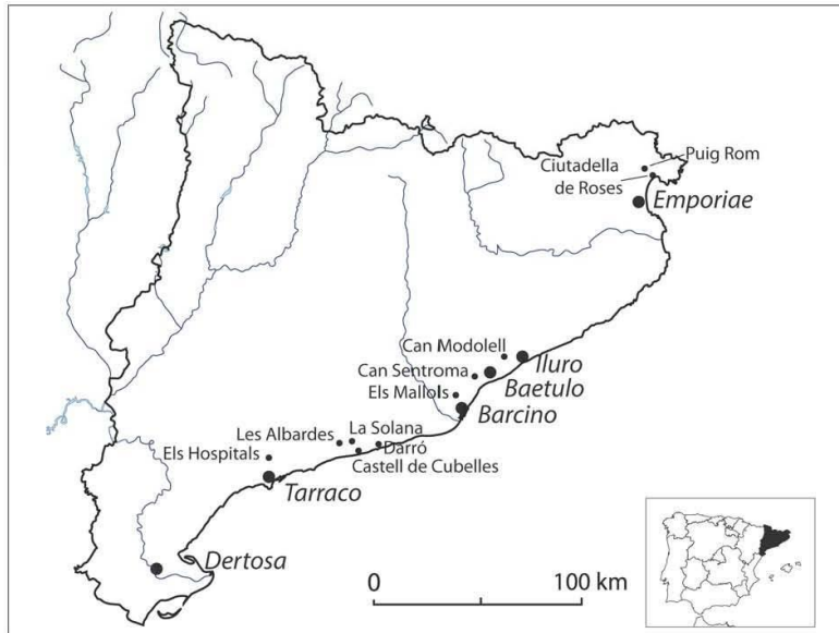
Figure 1. Late Roman sites in Catalonia mentioned in the text